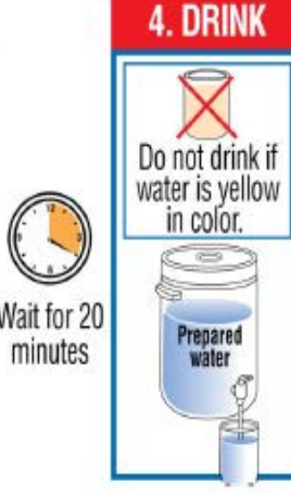
Each sachet is suitable to treat 10 litres / 2.5 gallons of water